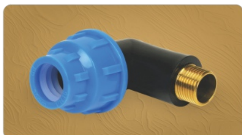
BRASS THREAD M.T.A. ELBOW