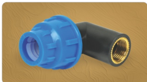
BRASS THREADED ELBOW