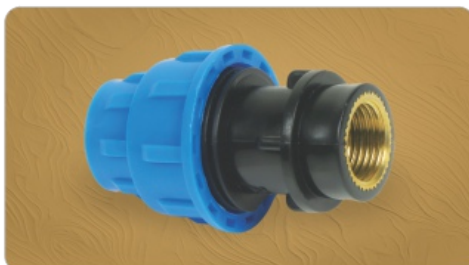
BRASS THREADED F.T.A.