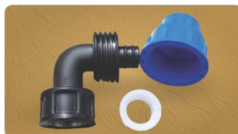
COMPOSITE PIPE ELBOW