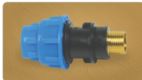
BRASS THREADED M.T.A.