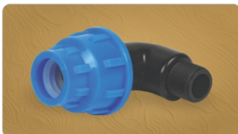
PLAIN MT ELBOW